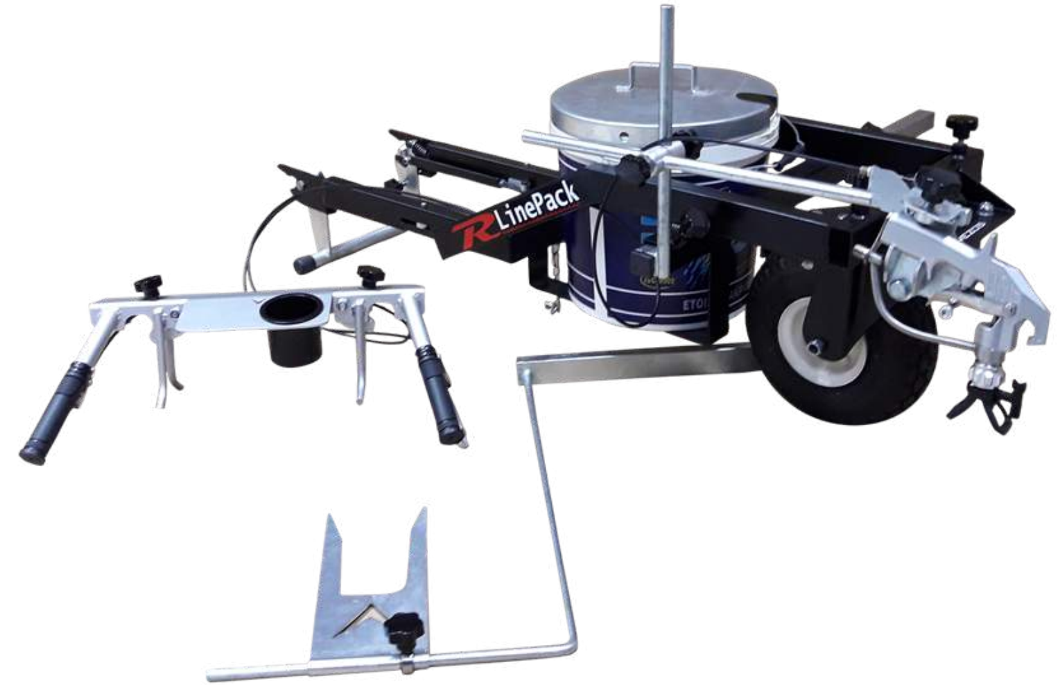
R-LINEPACK Complete Kit p/n 23.7001001